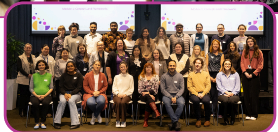
Photos from the 2025 Masterclass