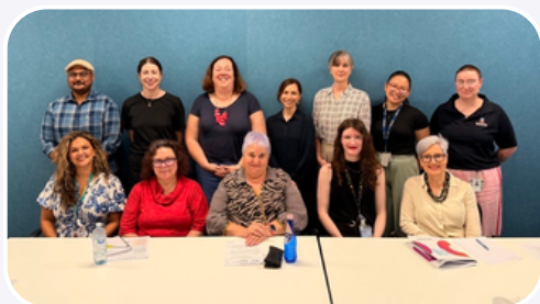
February CoP attendees

For the February Research-Translation Community of Practice meeting, special guest EJ Baird demonstrated how boundary spanning can occur in unexpected contexts through the lens of a case study from her previous consulting role. The key messages of this have been distilled into a short case study, with useful takeaway messages - read it now!