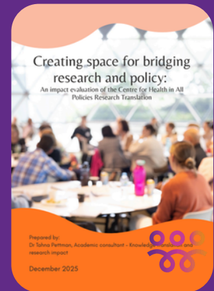
CHIAPRT Impact Evaluation